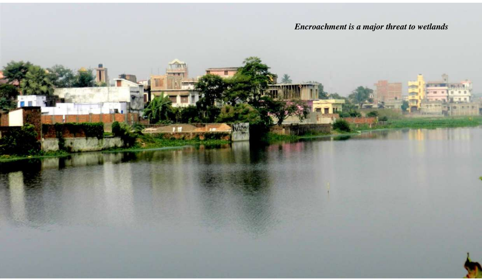
Encroachment is a major threat to wetlands

Management of wetlands calls for continuous research inputs to address the drivers of change. However, research has not been given due importance in case of most of the wetlands. Much of the research is focused on structural elements of wetlands (limnology, biodiversity)